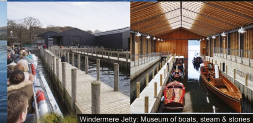
Windermere Jetty: Museum of boats, steam & stories