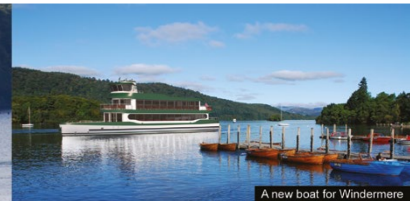
A new boat for Windermere