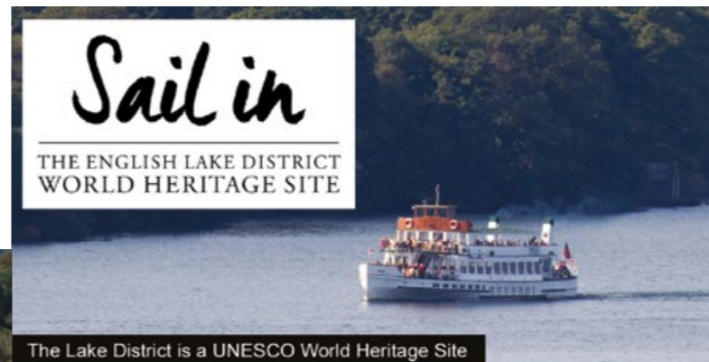
The Lake District is a UNESCO World Heritage Site