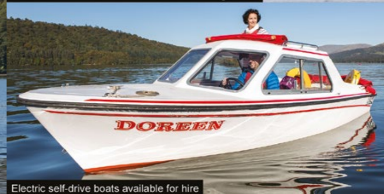
Electric self-drive boats available for hire